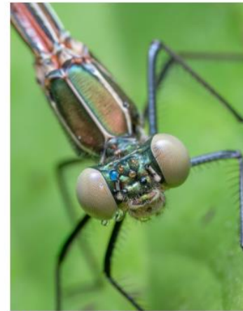
Mika Geiger, Balcones Canyonlands

Many communities and organizations rely on such citizen volunteers for implementing youth education programs; for operating parks, nature centers, and natural areas; and for providing leadership in local natural resource conservation efforts. In fact, a short supply of dedicated and well-informed volunteers is often cited as a limiting factor for community-based conservation efforts.